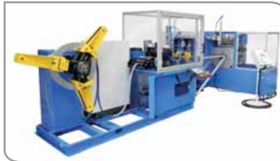
Machine with coil line