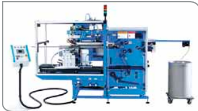
Stand alone solution