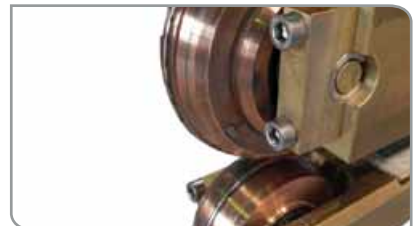
DISCON mercury free cooling solution