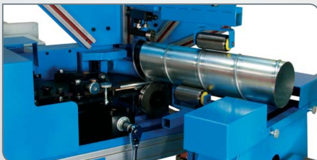
Spiro® Alpha 6 forming tapes